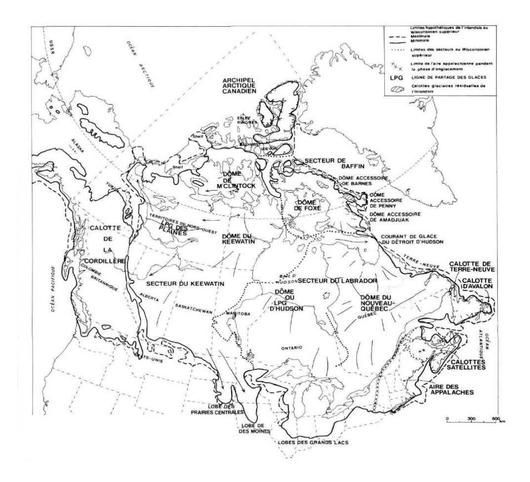
Figure: Domes, ice divides and maximum extent of Laurentide ice-sheet (LIS) at the last glacial maximum (LGM). (Occhietti et al., 1987)

The maximum volume of the laurentide ice-sheet is estimated to 18*10^{6} km<sup>3</sup> (Occhietti et al., 1987). It extended on 4200 km east to west and 3700km north to south reaching its maximum area at 12.5*10^{6} km<sup>2</sup>. At the LGM, towards 18\pm4 ka, the thickness of the ice varied between 3200m and 400m. Starting from the main dispersion sectors situated on the Canadian Shield, the LIS covered the sedimentary platform of the Canadian plains to reach the foothills of the Rockies on the west margin. A possible coalescence of the LIS and the Cordilleran ice-sheet in the uppermost latitude (west-central Alberta to 60^{\circ} north) and southernmost latitude (southern Alberta to Montana) of that margin is believed to have occurred near 18ka (Dyke et Prest, 1987). An ice free discontinuous corridor is believed to have existed between those coalescent margins. Numerous discontinuous deposits are locally overridden each showing a pattern of advance/retreat or overlapping of the ice flow (Occhietti et al., 1987). The east and southeast